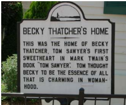
A sign outside the home offers visitors a bit of history

to make the experience even more real for visitors who travel from all over the world to see this beautiful home.