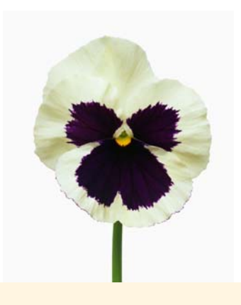
"...his face lit up, right away, for she tossed a pansy over the fence a moment before she disappeared."